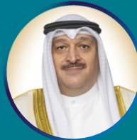
H.E. DR. AHMAD AL-AWADHI MINISTER OF HEALTH KUWAIT