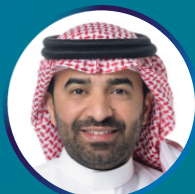
ENG. MERAEE AL QAHTANI DEPUTY MINISTER FOR LOCALISATION & HUMAN CAPITAL MINISTRY OF HEALTH SAUDI ARABIA