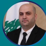
H.E. DR. RAKAN NASREDDINE MINISTER OF PUBLIC HEALTH LEBANON