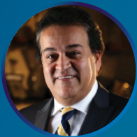
H.E. PROF. KHALED ABDEL GHAFFAR DEPUTY PRIME MINISTER & MINISTER OF HEALTH & POPULATION EGYPT