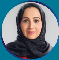
HE. DR. JALEELA JAWAD HASAN MINISTER OF HEALTH KINGDOM OF BAHRAIN